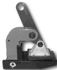
Horizontal Non-Marring Lifting Clamp (IPHNM). 2 Types: WLL 0.5 and 1 ton