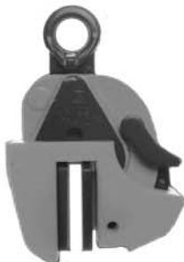
Vertical Non-Marring Lifting Clamp with Protection Cap (IPNM/P). 2 Types: WLL 0.5 ton and 1 ton