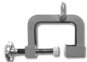
Vertical Non-Marring Screw Clamp (IPSNM). 2 Types: WLL 0.1 and 0.25 ton