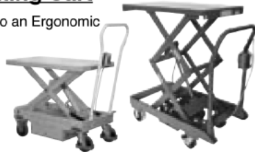
model CART-1000-DC model CART-DS-1000