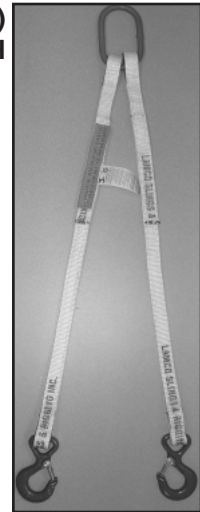
Double Leg (2L) O-H